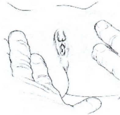
Supine Labial Separation